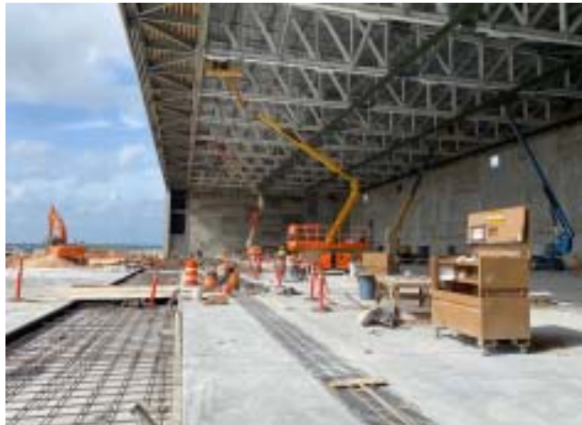
Aircraft Maintenance Hangar #2