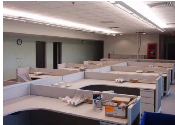
Military Working Dog Facility