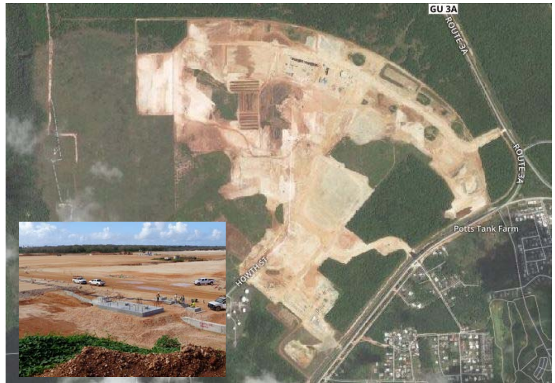
Utilities & Site Improvements Phase I