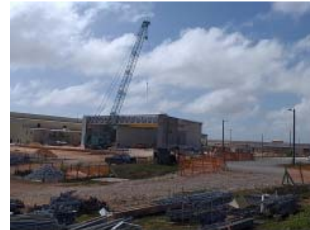
Corrosion Control Hangar