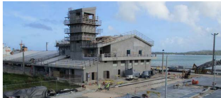
Waterfront Headquarters Building