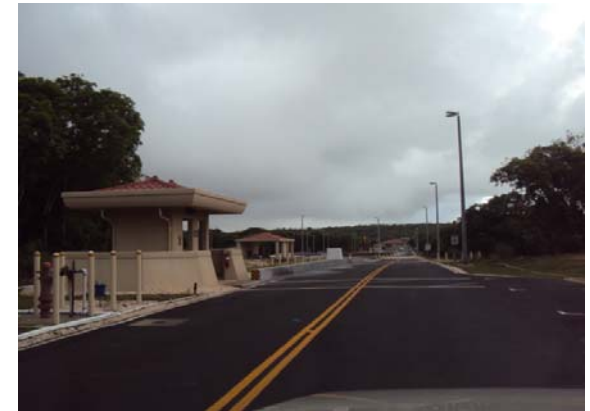
Apra Utilities & Site Improvements Phase I